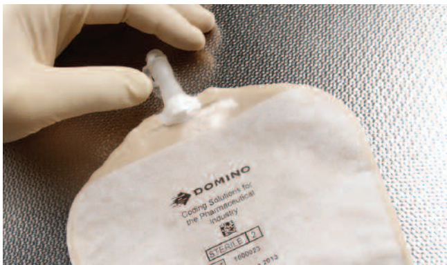
Real time clocks, off sets, graphic, standard barcodes plus RSS and Data Matrix coding