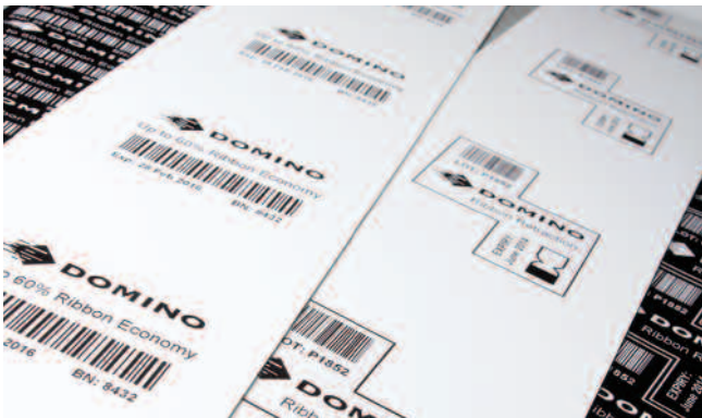
Ribbon economy and retraction features for V200 and V400

V-Series controllers offer powerful printer control and on-board label creation. They can be networked for remote operation and are compatible with a variety of external label creation and networking solutions.