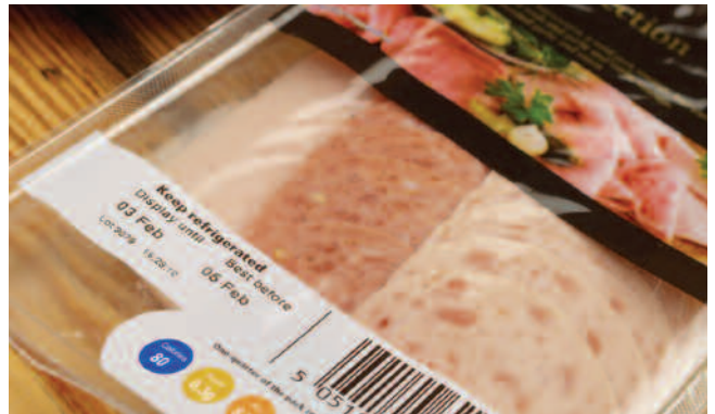
Clean technology ideally suited to all production environments including food and pharmaceutical

EASYDESIGN allows remote label creation via PC and quicker design of more complex codes. It is economical, easy-to-use and simply transfers the label design between PC and V-Series controller via ethernet or serial interface.