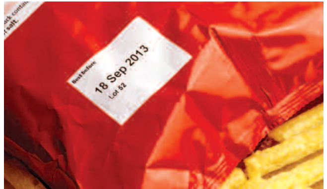
Ideal for high volume manufacturing