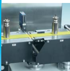
Ultra-lightweight weighing conveyor – core of the XS1 system