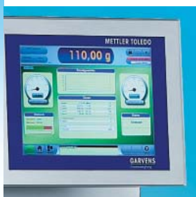
Colour touchscreen Large 15" display for best visibility and easy operation

The "small" GARVENS. Designed specifically for small lightweight products.