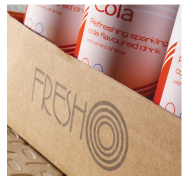
High quality text, graphics