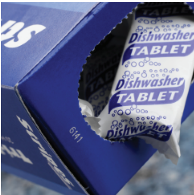
Letter quality codes reduce the risk of costly returns