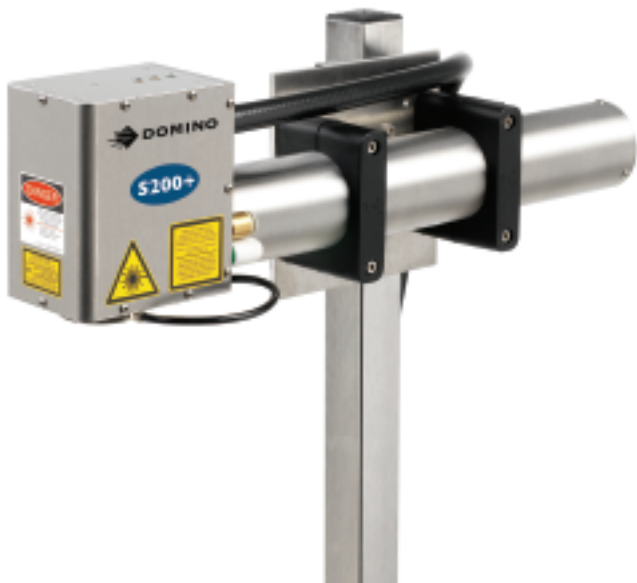
The S-Series plus part of the Domino plus programme