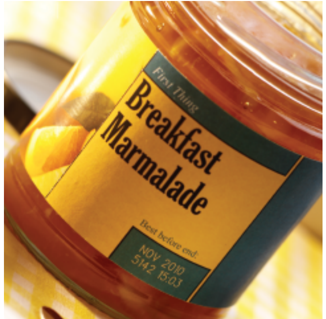
Multiple line codes can be printed on a wide range of substrates