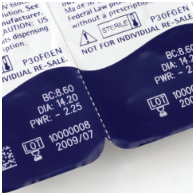
Quality, legible codes are ideal for the demands of the pharmaceutical industry