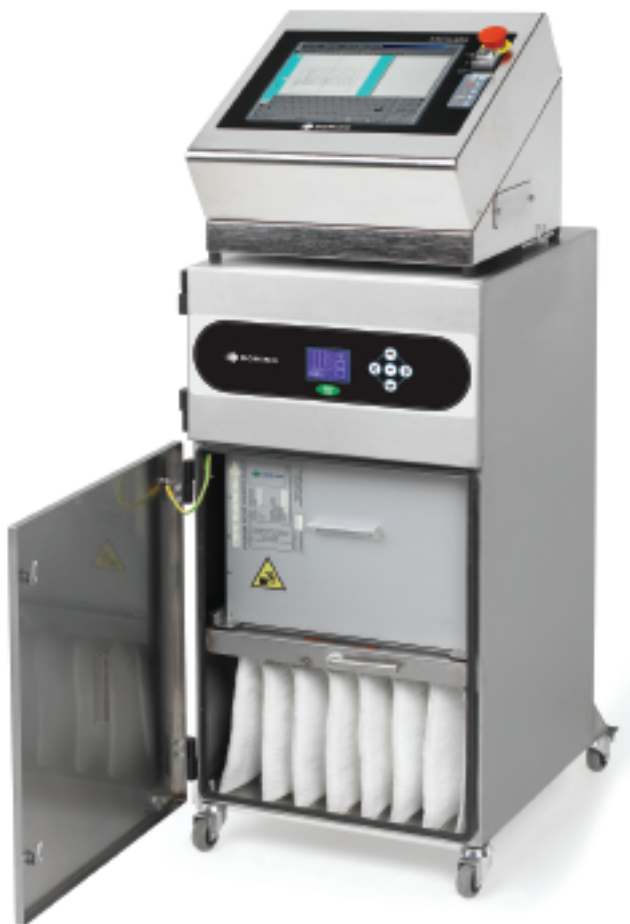
Efficient and effective coding is ensured with the Domino DPX fume extraction system

The S-Series plus range of printers has a direct interface to the Domino DPX for automatic extraction of fumes and particles produced during laser marking. This ensures efficient and cost-effective laser coding as well as safeguarding the production environment and personnel.