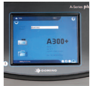
Optional touch screen control