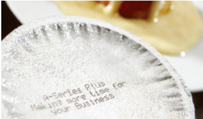
Up to 4 line coding in wash down environments

The Domino A-Series plus range of continuous ink jet printers, deliver proven performance and high reliability ranging from basic coding applications through to those requiring networking capabilities and the highest print quality in the harshest production environments.