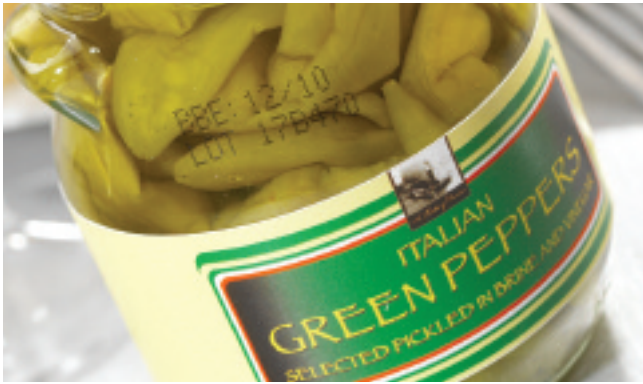
Print variable data for full traceability

A-Series plus networking capabilities allow remote monitoring without the need for special software.