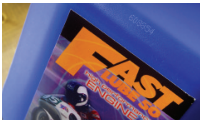
High contrast inks for dark surfaces