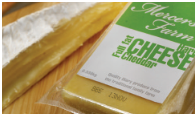
Wide variety of inks to suit modern packaging materials

The A-Series plus offers unrivalled reliability and connectivity, delivering a coding solution that provides increased production efficiencies by addressing the most common and important sources of manufacturing productivity loss.