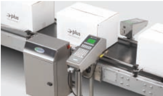
The C-Series plus part of the Domino plus programme