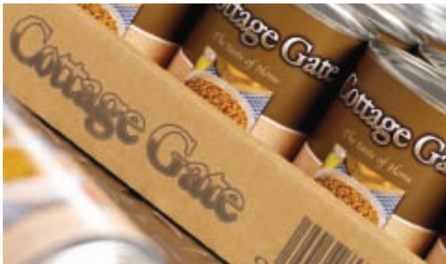
Remote head variants for low level tray coding