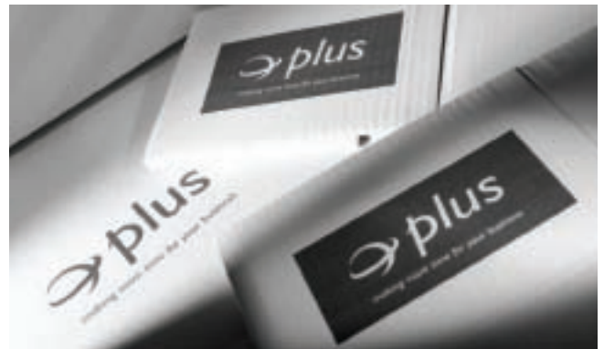
High quality text and graphics capability