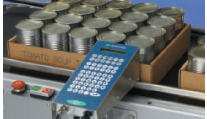
The C-Series standard alphanumeric coder