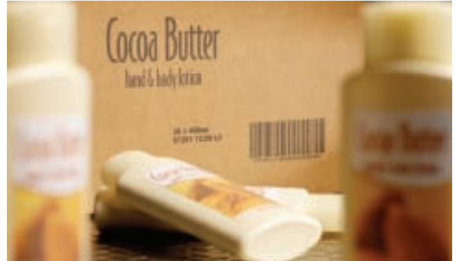
Multi-head C-Series plus on blank outer cases