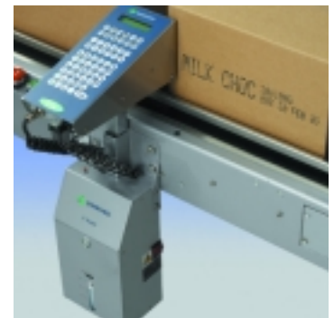
Small, compact and unobtrusive